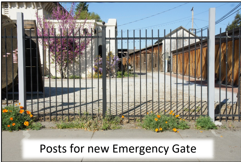
Posts for new Emergency Gate