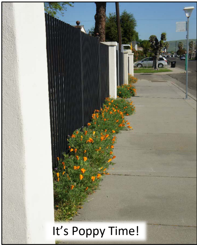
It's Poppy Time!