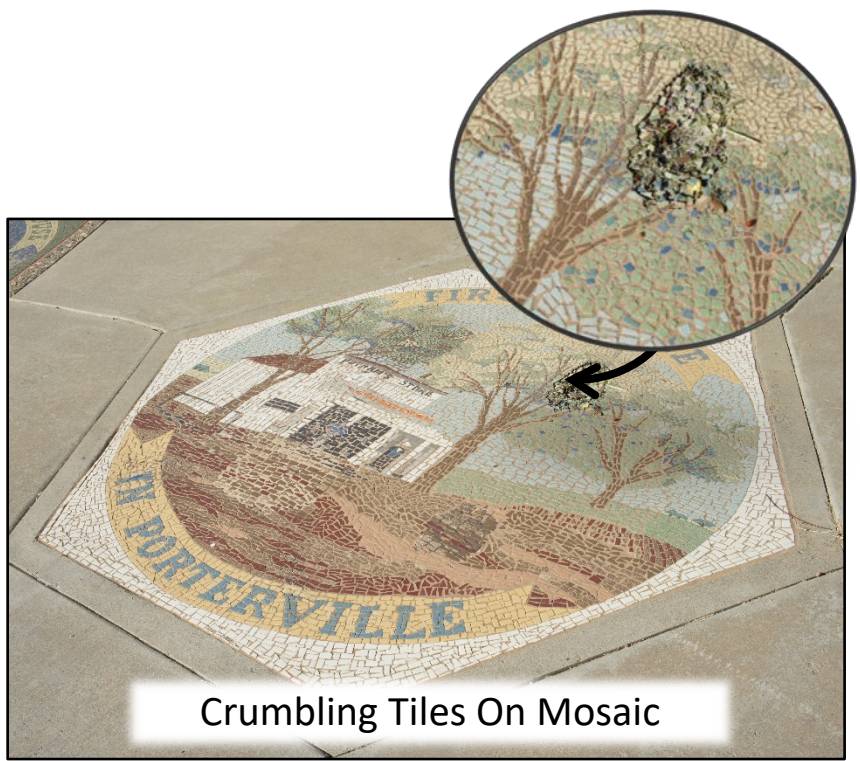
Crumbling Tiles On Mosaic