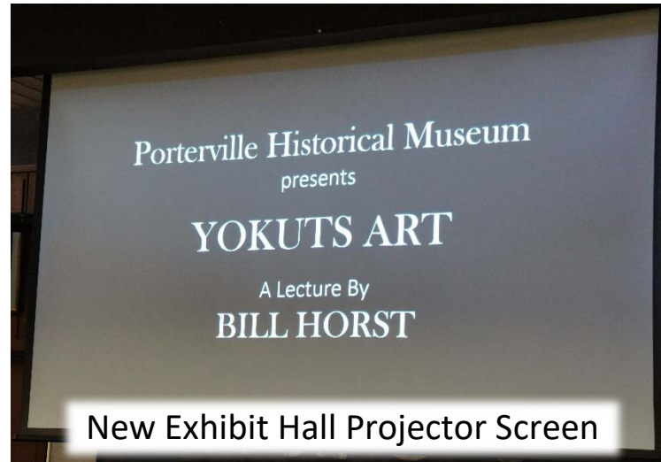
New Exhibit Hall Projector Screen