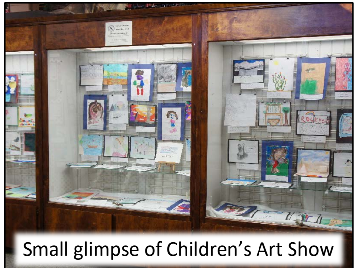
Small glimpse of Children's Art Show