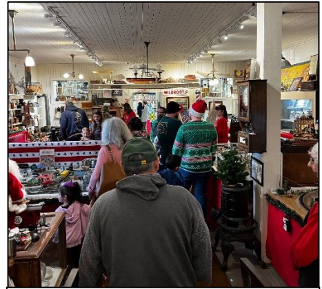
Crowds enjoyed the 38 th annual train show.