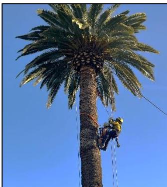
A firefighter rescues a “victim”.

Fire Department Rescue Training – On November 16 the museum’s big palm tree took center stage in a special “Arborist Rescue” class conducted for the Porterville and Lindsay Fire Departments. Using a fire department ladder truck, ropes, rope launcher, and special climbing equipment, firefighters practiced a variety of methods for rescuing tree trimmers who become injured or trapped high in trees. It was our pleasure to host the training and we want to thank our volunteers for firing up the grill to provide lunch for the 40 or so firefighters who participated.