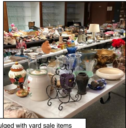
The Exhibit Hall and Patio bulged with yard sale items

outstanding job they did getting sale items cleaned, sorted, organized, and displayed and sold!