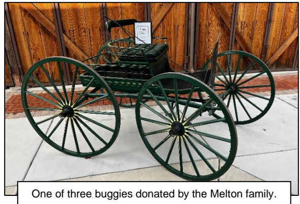
One of three buggies donated by the Melton family.