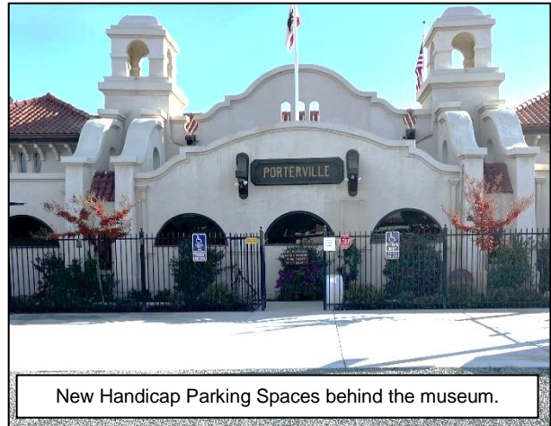
New Handicap Parking Spaces behind the museum.

Handicap Access Improved – We're pleased to announce that just prior to the train show four new concrete parking spaces were installed in the parking area at the back of the museum. This includes two handicap spaces, one of which is van accessible. Additionally, a new sidewalk was poured along the entire front of the car barn, and a connecting walkway to it from the front of the museum. Ramirez Custom Concrete did the cement work under contract, but also graciously donated and spread several tons of crushed rock in our parking lot, and decomposed granite in some areas at the front of the museum. Many thanks to them!